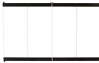
Glass bi-fold doors