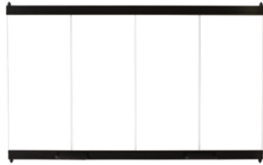
Standard Fixed Glass Doors