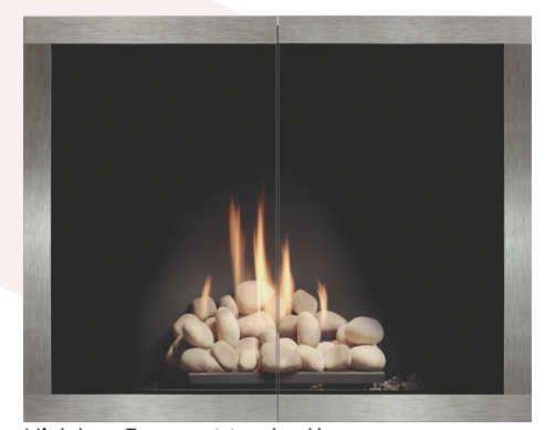
Hidden Frame Manhattan