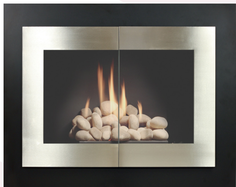
Regular Frame Manhattan